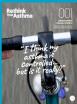
ISSUE 001 UNDERSTANDING ASTHMA CONTROL

Download all 5 magazines dedicated to helping you understand your asthma at TheNextBreath.com/I-Have-Asthma