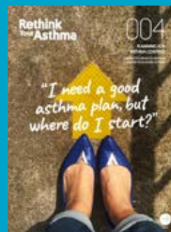
ISSUE 004 PLANNING FOR ASTHMA CONTROL