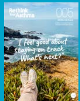
ISSUE 005 STAYING ON TRACK