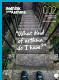
ISSUE 002 KNOWING YOUR ASTHMA TYPE